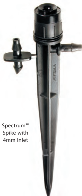
Spectrum™ Spike with 4mm Inlet