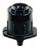
Spectrum™ Thread 4 mm