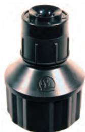
Spectrum™ Thread 1/2" FNPT